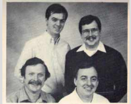
Men's Club Officers 1986

You may also choose to RSVP and pay for the September 10 meeting ($15) via this form or the online form if you are returning it by September 7, 2020